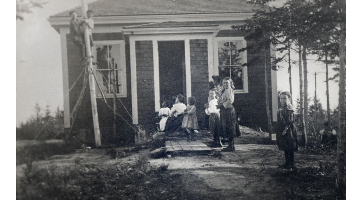
ABOVE: School children on Malaga Island, circa 1910 [Courtesy Peter K. Roberts] BELOW: Unidentified group on Malaga Island, circa 1910 [Courtesy Peter K. Roberts]