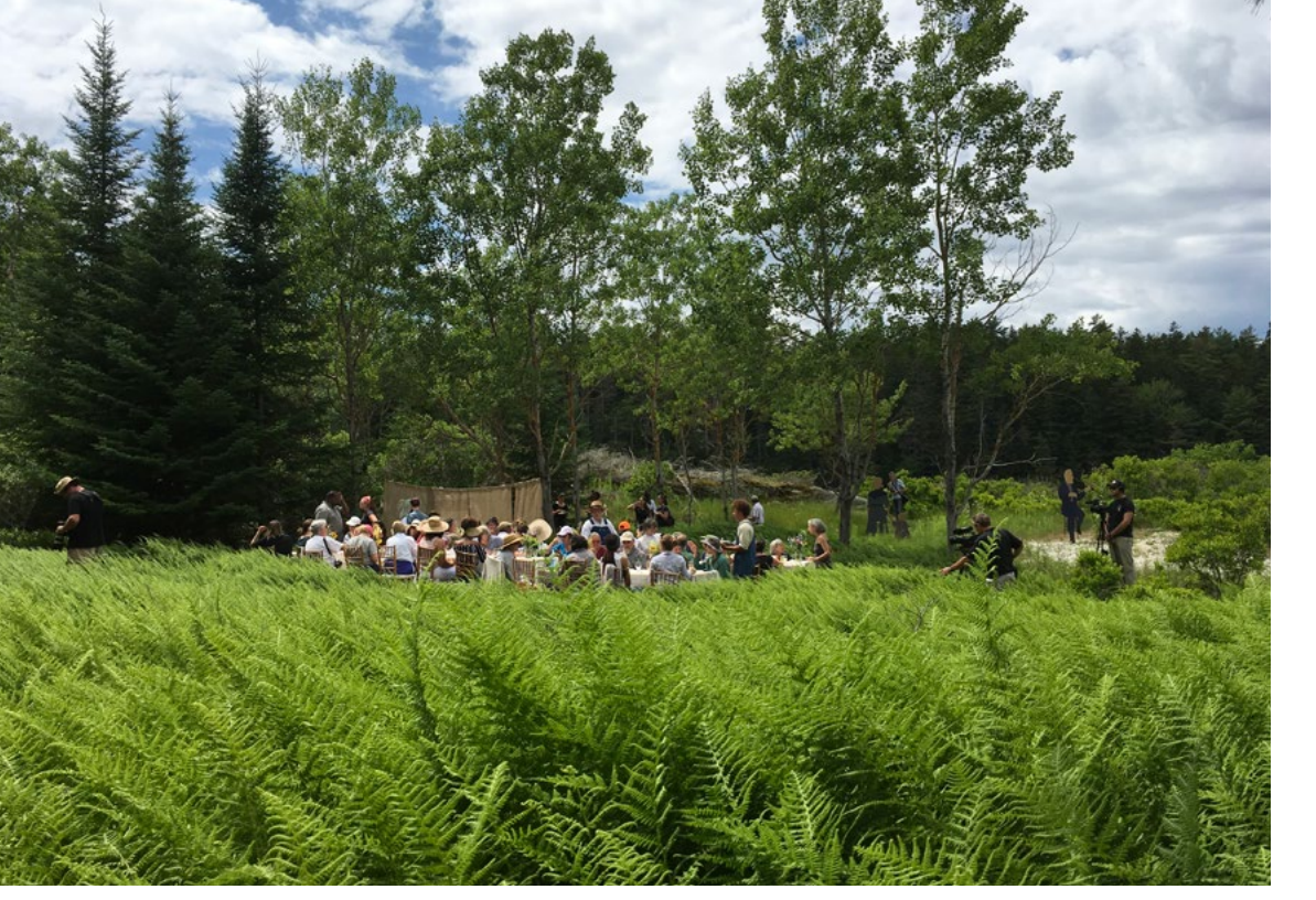
The Re:Past performative dinner memorial