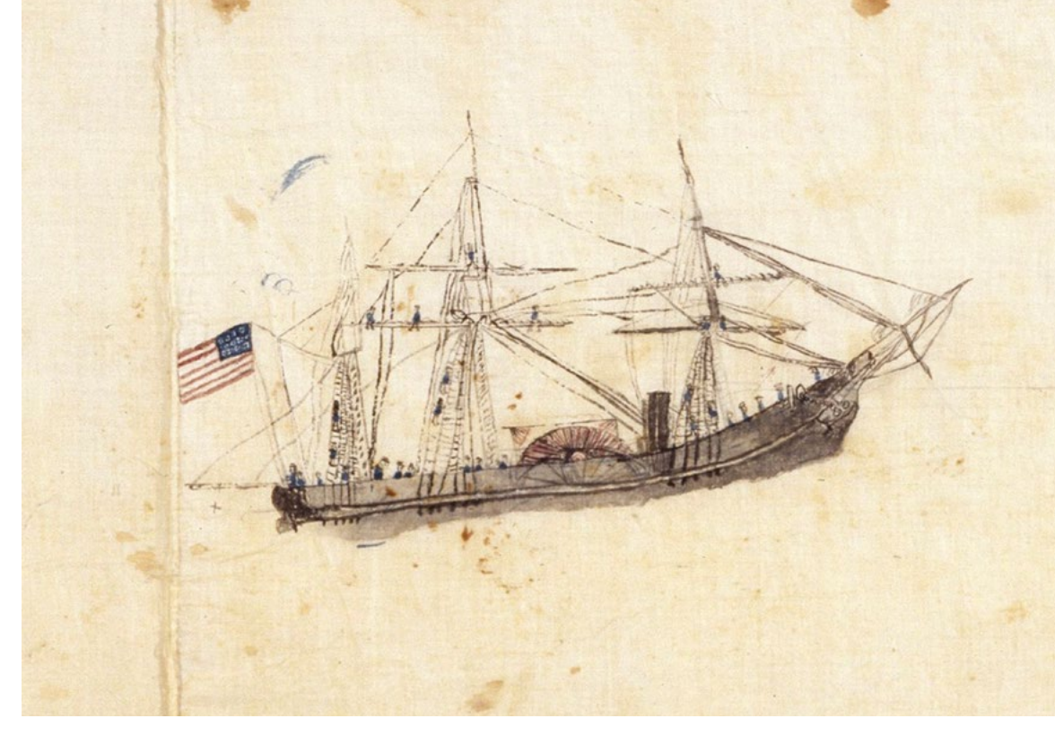
Slave ships the Porpoise (above) and the Malaga hailed from Brunswick, Maine and traveled to Africa to transport enslaved people to Brazil

On July 1, 1912, the state of Maine completed its formal eviction process of the residents of Malaga Island, institutionalizing (and even sterilizing) several community members and displacing the rest. While the island and its residents were deeply impoverished, the community fostered deep bonds of kinship, family, and mutual progress, relying upon each other for their physical, social, and spiritual needs. The