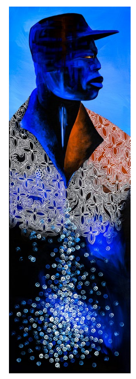
Witness to the Unseen -Three