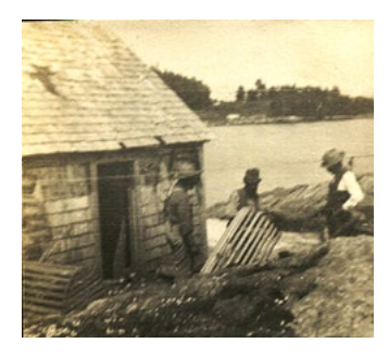
Lobstering on Malaga Island, circa 1910