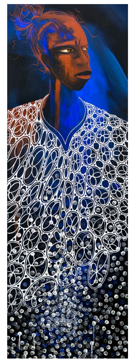
Christina's Song - Two (Christina's Fire)