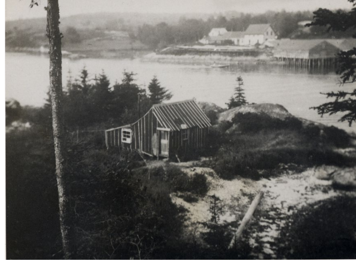
Tarpaper house on Malaga Island, circa 1910

dominant ship building industry at the same time as a serious decline in fish stocks. As jobs disappeared, more and more people like the residents of Malaga turned to their towns for financial assistance. Most coastal towns looked to tourism as the new industry that would save the coast of Maine. At the same time, the Eugenics Movement began to thrive in America at the turn of the 20th century, adding to the already existing racism and driving social and state-sponsored practices