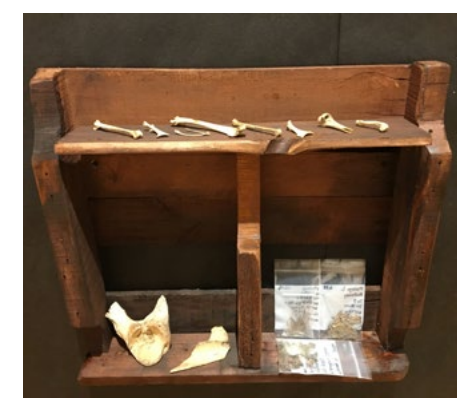
Bones, remnants of everyday life, reflect the community's diet: duck, beef, pork, and fish

Daniel shared a plan to construct a symbolic Malaga house in the gallery. Anyone would be able to walk through it; placing them in the art and by extension, in the Malaga community. Piles of artifacts, grouped by type – buttons, fishhooks, bone, nails, would be placed as if a paper bag holding them burst, leaving them as residue. This is an excellent analogy to how we